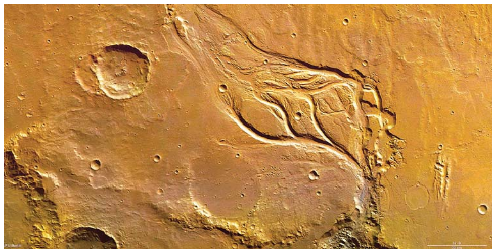
View from space showing Osuga Valles, an outflow channel thought to be eroded by catastrophic flooding on Mars.

Poems submitted to the contest can be in any form, but they should relate in some way to stars, planets, sun, moon, space exploration, or the night sky. Poems should be submitted on the special entry form provided. For the 2014 contest details and a link to the submission form, see: http://astronomerswithoutborders.org/gam2014-programs/astroarts/1467-astro-poetry-contest-for-gam2014.html