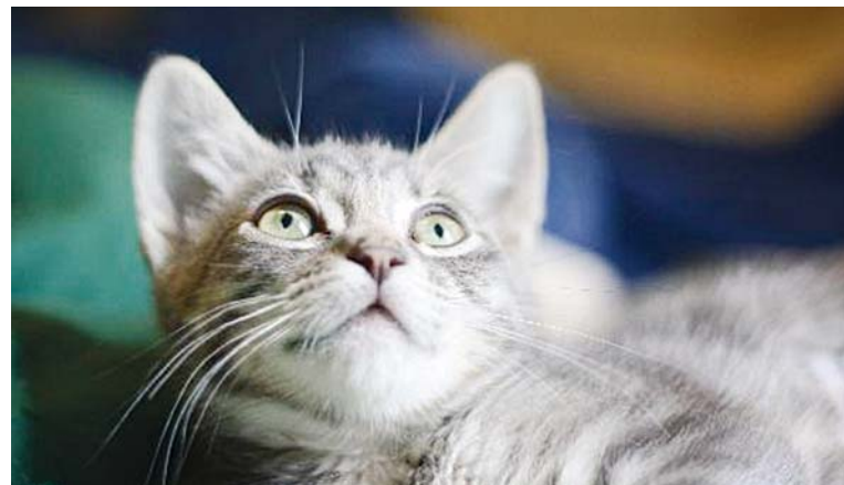
Glitch would love to come home and meet a new playmate.

Glitch’s siblings have all been adopted and now it’s her turn! She is an adorable, affectionate little tabby girl. Let her find her favorite place cuddled up close as possible to you, purring. Glitch is a playful, active