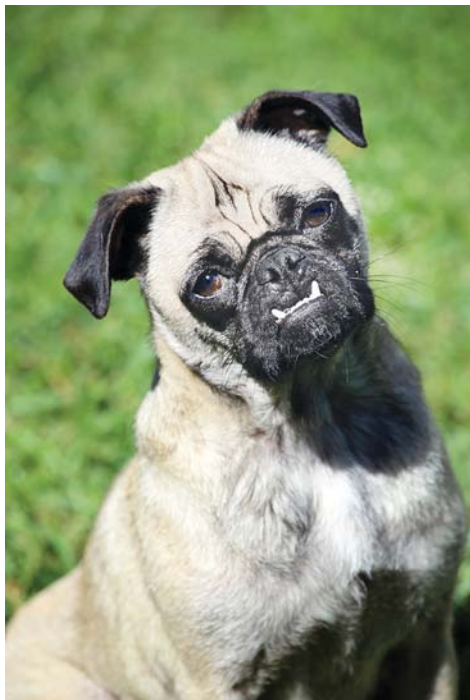
April loves to play and follow her friends around.

April is a sweet year old Pug with the cutest underbite. She is very playful and has a very sweet, loving personality. She is fine with all other dogs and is settling into her foster home well. April crates great at night, not a peep. She loves to chew on her nyla bone and will chase small stuffed toys when you throw them. As most Pugs do, she loves to be with you and will follow you from room