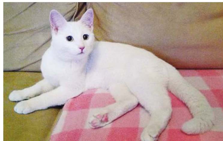
Casper is just a baby kitten who wants to play.

Be kind. Save a life. Support animal rescue. •