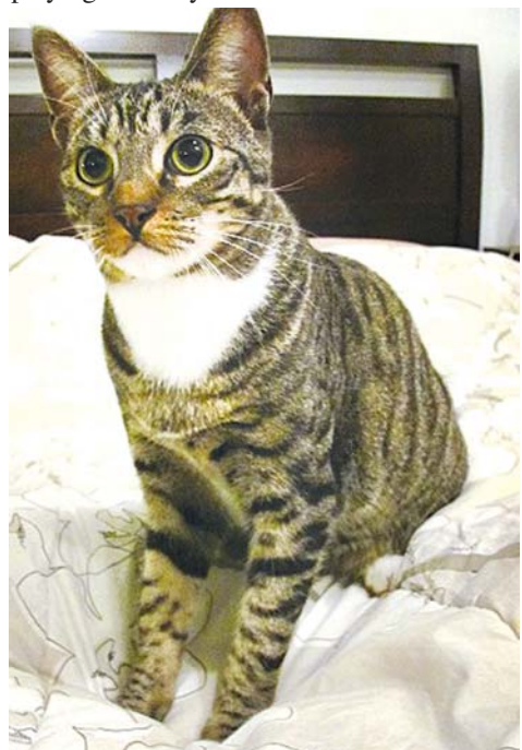
Q loves to be petted and brushed.

“ Q ” is a beautiful brown tabby boy. He and his siblings were abandoned as kittens and he was a little nervous with people when he was rescued. But once he got to know his foster family, Q showed his true colors as the friendly, sweet cat he is. He loves being petted and brushed (and even lint rolled!). Q will show his tummy and ask you for pets and playtime. Active and playful, he loves playing with toys and other cats!