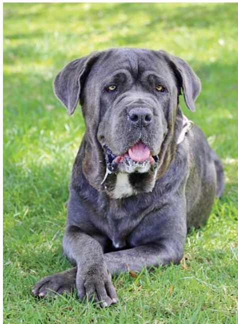
Bisha is so well mannered and needs a low-stress household.

Adopt a “Pet Without a Partner” and Give a Homeless Pet a Second Chance in Life